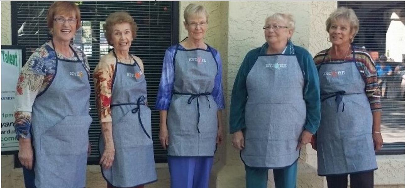
These ladies are modeling the new aprons for our workers at the Craft Show.